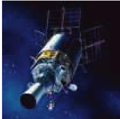
Defense Support Program satellites provide early warning of a missile attack.

Proper use of ISR assets is critical to the planning, conduct, and assessment of nuclear operations. ISR affords the commander the ability to gather information and make decisions in a timely fashion. Warning systems must be in place that allow civilian leaders to determine if a nuclear response is appropriate. Planners must have the means of finding decisive targets and determining the proper weapon to employ. Post-attack assessment of both friendly and enemy capabilities is essential for determining the need for and ability to conduct follow-on attacks.